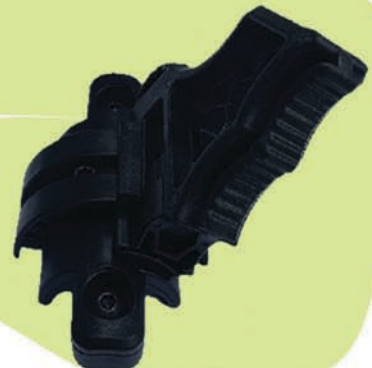
Rotated at 30°